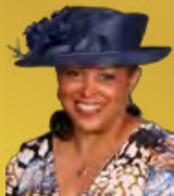
Friendly C.O.G.I.C. Oceanside, CA