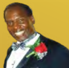
Soul Deliverance Ministries COGIC Los Angeles, CA